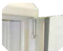
Quick release door