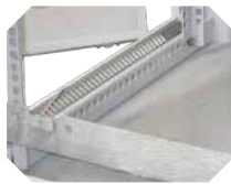
Sliding mounting angles